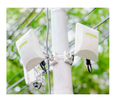
Outdoor WiFi Equipment