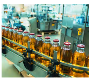
Food & Beverage Equipment