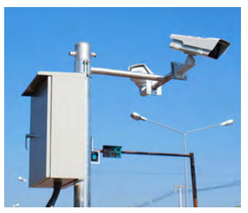
Traffic Control & Surveillance