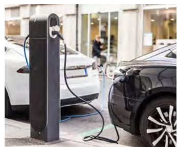
EV Charging Stations