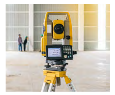
Optical Devices & Lenses

Telecom construction and management contractors endorse these flexible, easy-to-install sheets due to their ability to control humidity with long-lasting performance. 1.6 million sheets installed in communications equipment, terminal boxes and protection devices; Active-S sheets work.