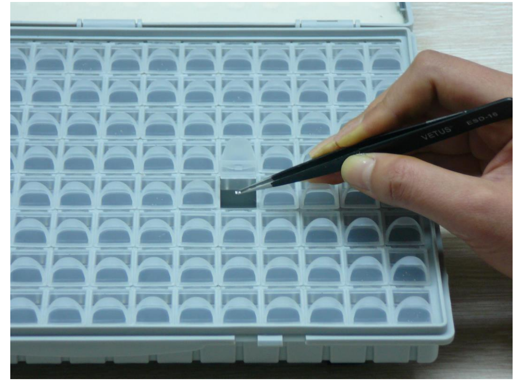
Figure 12. Storing or Obtaining an SMT Component