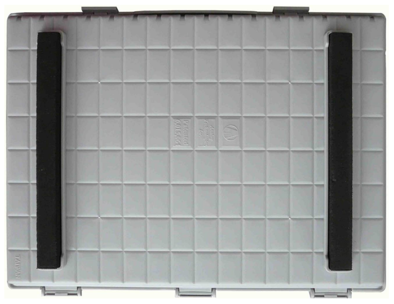
Figure 4. Bottom View of the SK128B