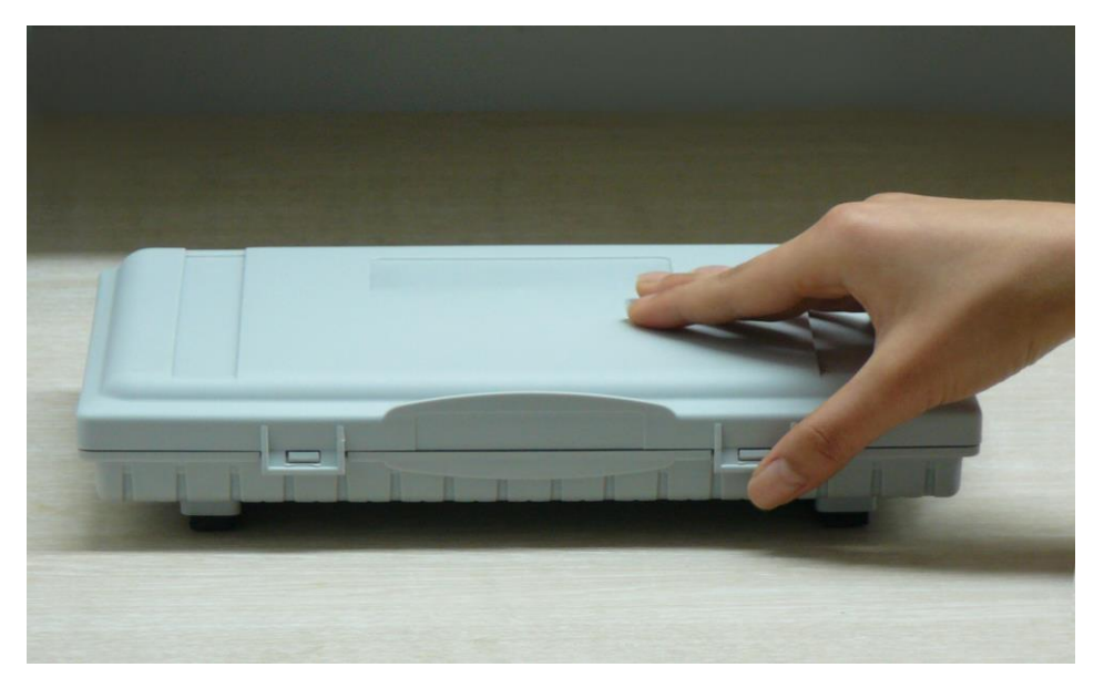
Figure 10. Putting the Enclosure SK128B on a Work Bench

When storing or obtaining an SMT component, use a pair of tweezers as shown in Figure 12.