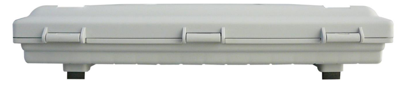
Figure 3. Back View of the SK128B