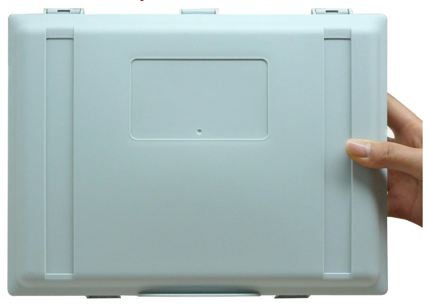
Figure 1. Top View of the SK128B