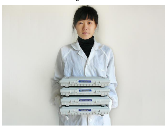
Figure 6. Stacking Up and Transporting the SK128B Super Kits Enclosures

The Super Kits Enclosure measures only 11"(L) \times 8.5"(W) (the letter paper size) \times 2.2"(H) (279mm(L) \times 216mm(W) \times 56mm(H)). Thus, they can be easily put on a work bench, stored on a shelf, or transported to another site, making them the best choice for building prototypes or reworking printed circuit boards. See below Figure 6.