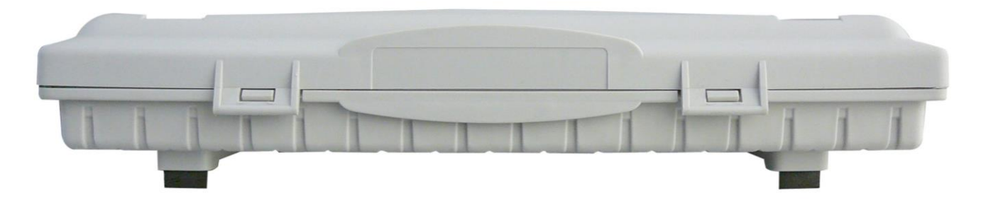
Figure 2. Front View of the SK128B