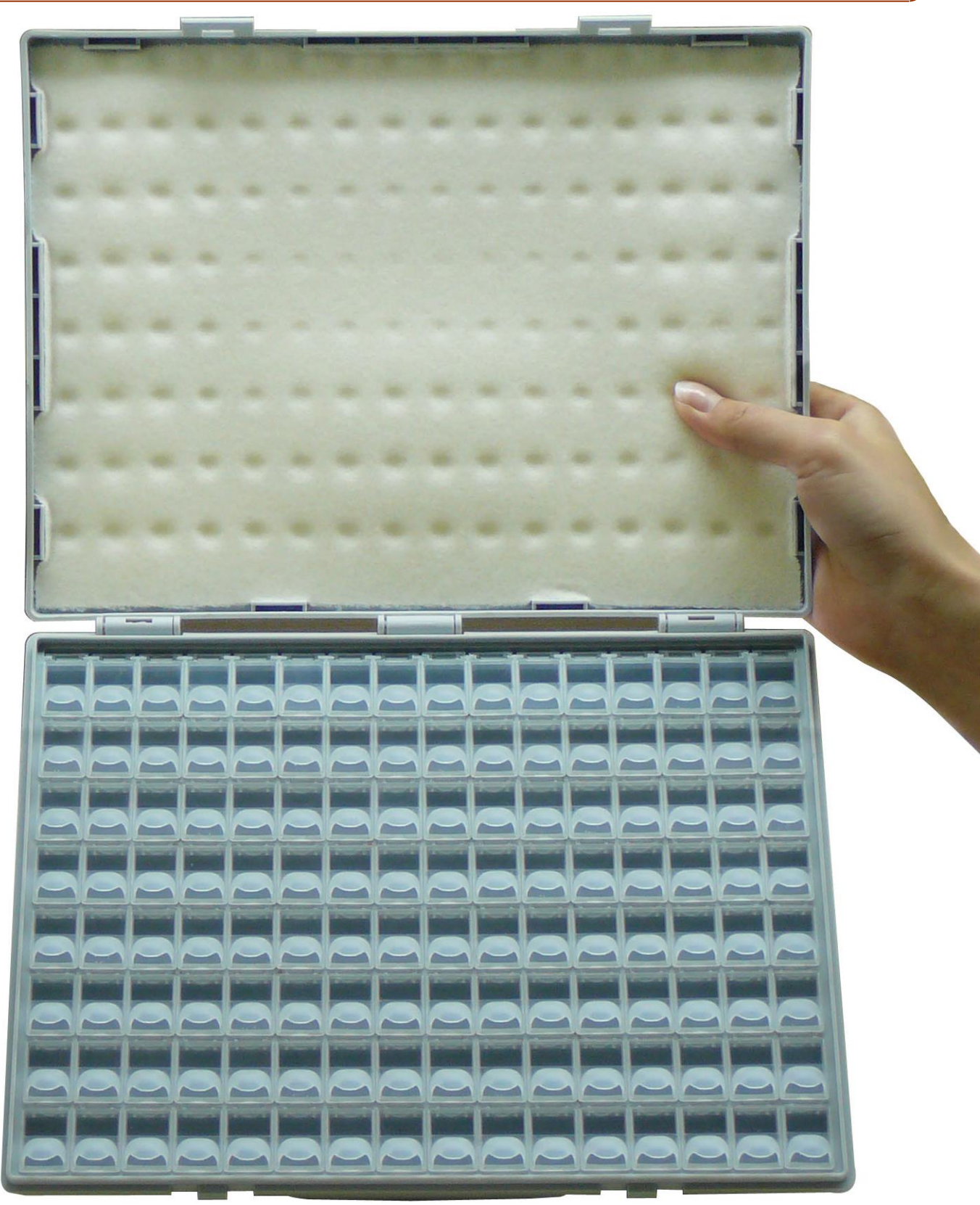
Figure 5. Internal View of the SK128B