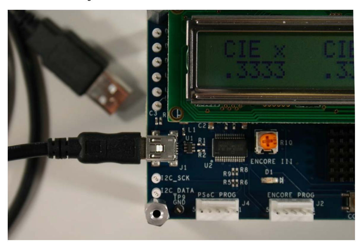
Figure 1-3. RGB Board with USB Control Cable Attached

When using the board with the RGB application, the board must be attached to the computer using a USB cable (included, see Figure 1-3). The board can be attached to the computer before or after the application is started.