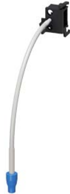
Cable release for reset 0.4 m for 3RU2 Size S00...S3