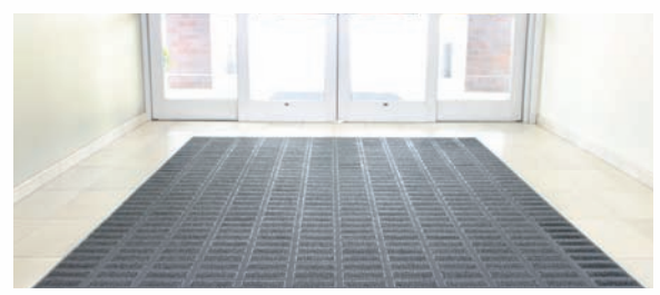
3M™ Entrance Matting can help further reduce the long-term maintenance costs of your facilities.

When used as a complete system, improves productivity and reduces operational costs