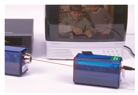
Figure 2. Equipment setup for transmitting video signals by light.