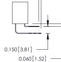
559 Contact Code

0.240 [6.10] Up to 27/54 Pin 0.162 [4.11] 28/56 and Over 0.290 [7.37] Up to 27/54 Pin .212 [5.38] 28/56 and Over