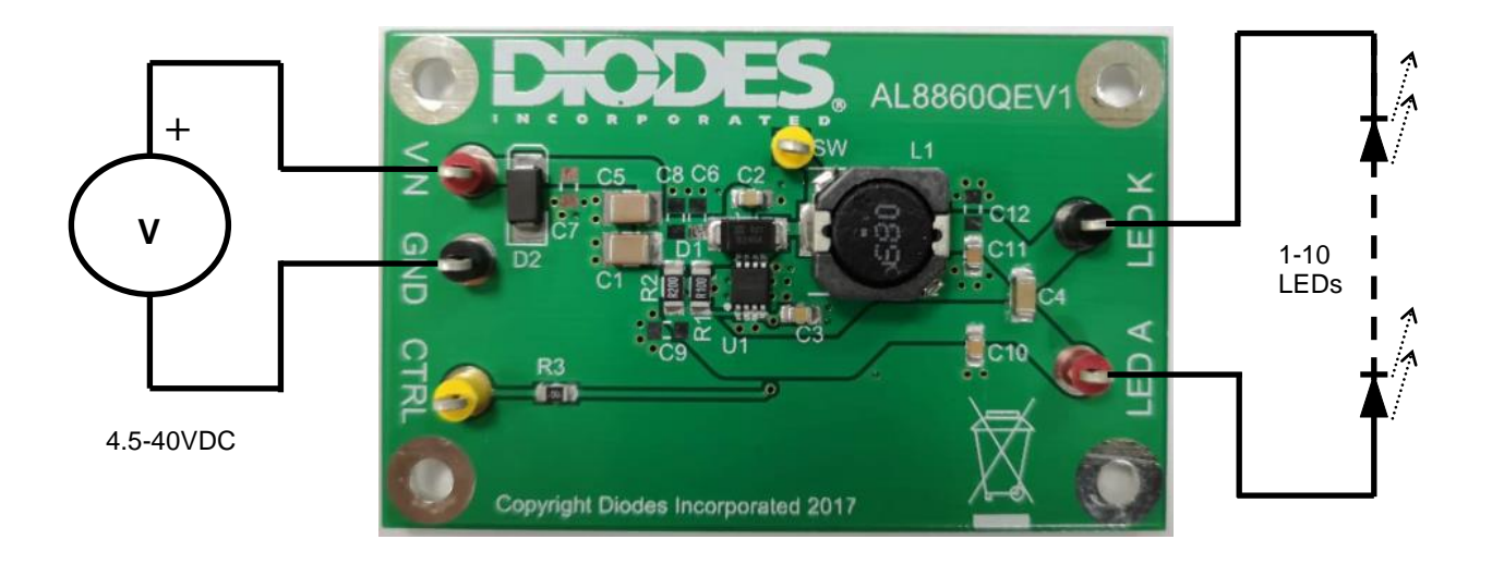
Figure 1: AL8860QEV1 evaluation board and connection diagram