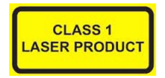
Figure 3. Class 1 laser product label

The VL53L3CX contains a laser emitter and corresponding drive circuitry. The laser output is designed to remain within Class 1 laser safety limits under all reasonable foreseeable conditions, including single faults, in compliance with the IEC 60825-1:2014 (third edition). The laser output remains within Class 1 limits as long as the STMicroelectronic's recommended device settings are used and the operating conditions specified in the datasheet are respected. The laser output power must not be increased and no optics should be used with the intention of focusing the laser beam.