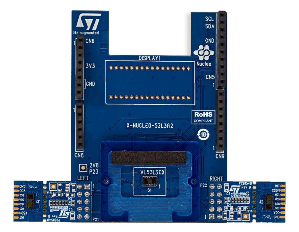
Figure 2. Connections of VL53L3CX breakout boards

When connected through flying leads, developers should break off the mini PCB from the breakout board, and use only the "VL53L3CX mini PCB" which is smaller and integrates more easily into customers devices